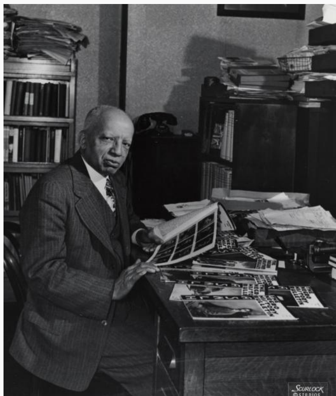
Dr. Carter G. Woodson, late 1940s

This impatience led Woodson to create Negro History Week in 1926, to ensure that school children be exposed to black history. Woodson chose the second week of February in order to celebrate the birthday of Lincoln and Frederick Douglass. It is important to realize that Negro History Week was not born in a vacuum. The 1920s saw the rise in interest in African American culture that was represented by the Harlem Renaissance where writers like Langston Hughes, Georgia Douglass Johnson, Claude McKay—wrote about the joys and sorrows of blackness, and musicians like Louie Armstrong, Duke Ellington, and Jimmy Lunceford captured the new rhythms of the cities created in part by the thousands of southern blacks who migrated to urban centers like Chicago. And artists like Aaron Douglass, Richard Barthe, and Lois Jones created images that celebrated blackness and provided more positive images of the African American experience.