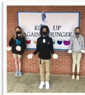
Empty Bowls Project, Westdale Middle