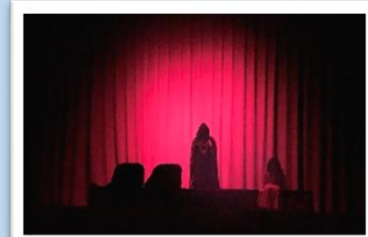
Shuddersome: Tales of Poe , Woodlawn High