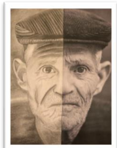
Photo Extension, Woodlawn Middle

Call 225-929-8642 to learn how to have your child evaluated for a Gifted and/or Talented Program.