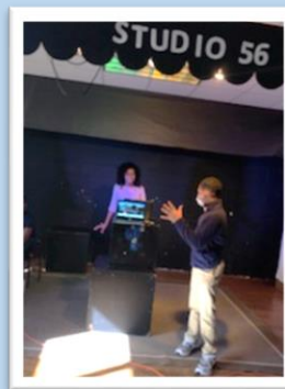
Original Monologue, Westdale Middle